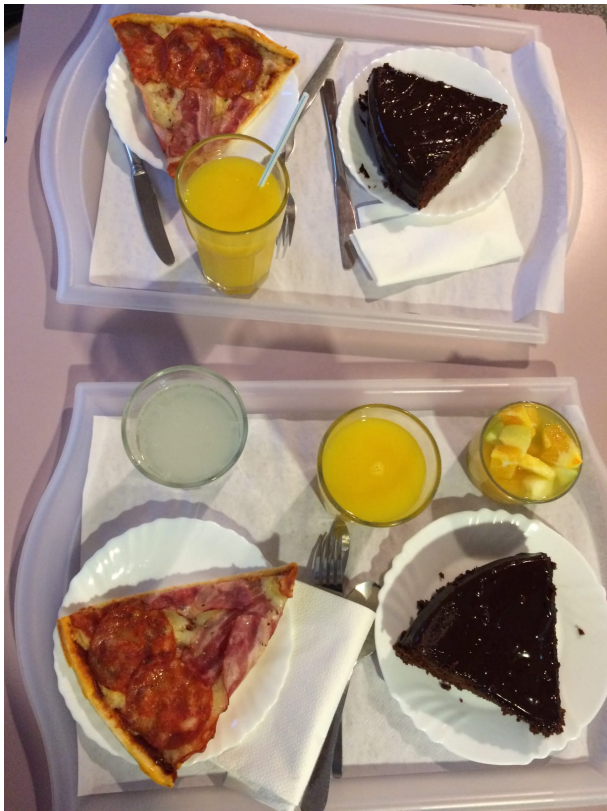
Figure 2: Arthur went to lunch with two friends and the only safe option for him was a fruit salad (see top right of the bottom tray).

the menu and ask questions, people with food hypersensitivities were likely to be the last ones to order, leaving all others waiting for their food. Delaying the service for everyone can be stressful but a necessary strategy to find safe options.